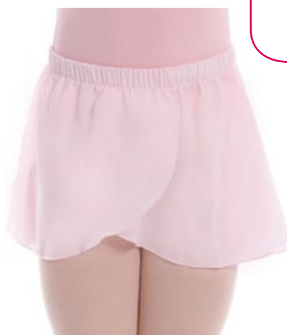
Mock Wrap Skirt • Pull On • Elastic Waistband