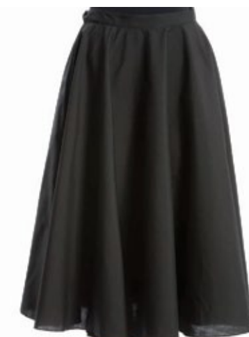
Character Skirt • Velcro adjustable waistband