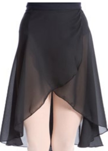
Long Wrap Skirt • Tie Back